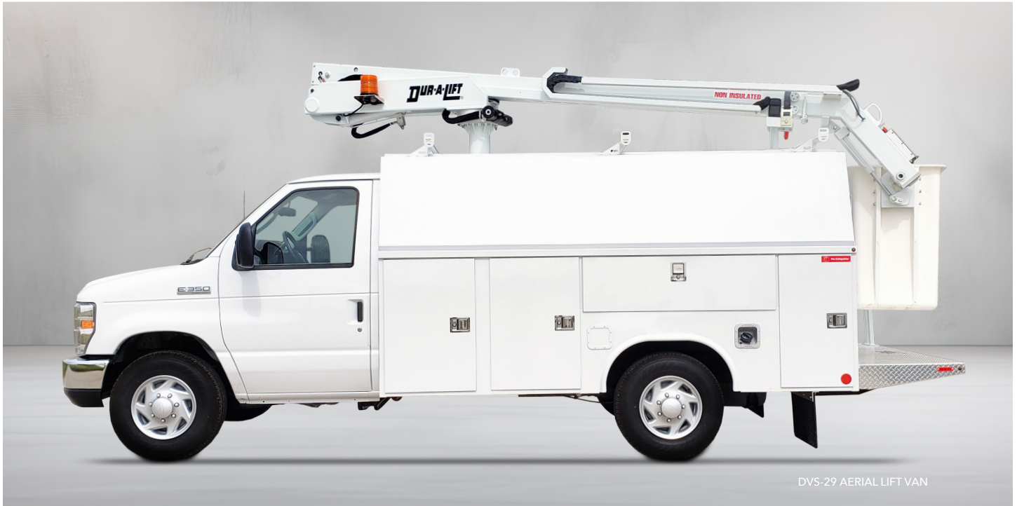
DVS-29 AERIAL LIFT VAN

TELESCOPIC AERIAL LIFT VAN SPLICING LAB & WALK-IN BASKET OPTIONS EXTERIOR & INTERIOR STORAGE OPTIONS!