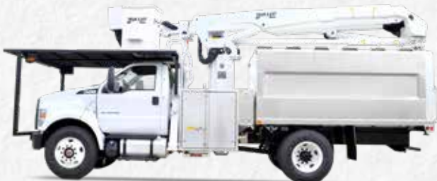
CHIPPER BODY DIMENSIONS: 11'9" (L) X 96" (W) 54" (H)