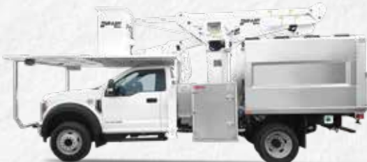
CHIPPER BODY DIMENSIONS: 7'6" (L) X 96" (W) 54" (H)