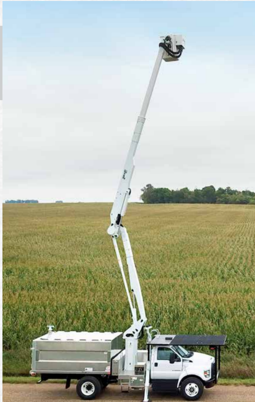
DPM2-52DP AERIAL; 33,000 GVWR CHASSIS; 11'9" BODY