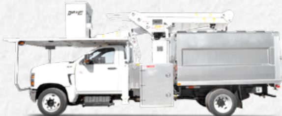
CHIPPER BODY DIMENSIONS: 9'9" (L) X 96" (W) 54" (H)