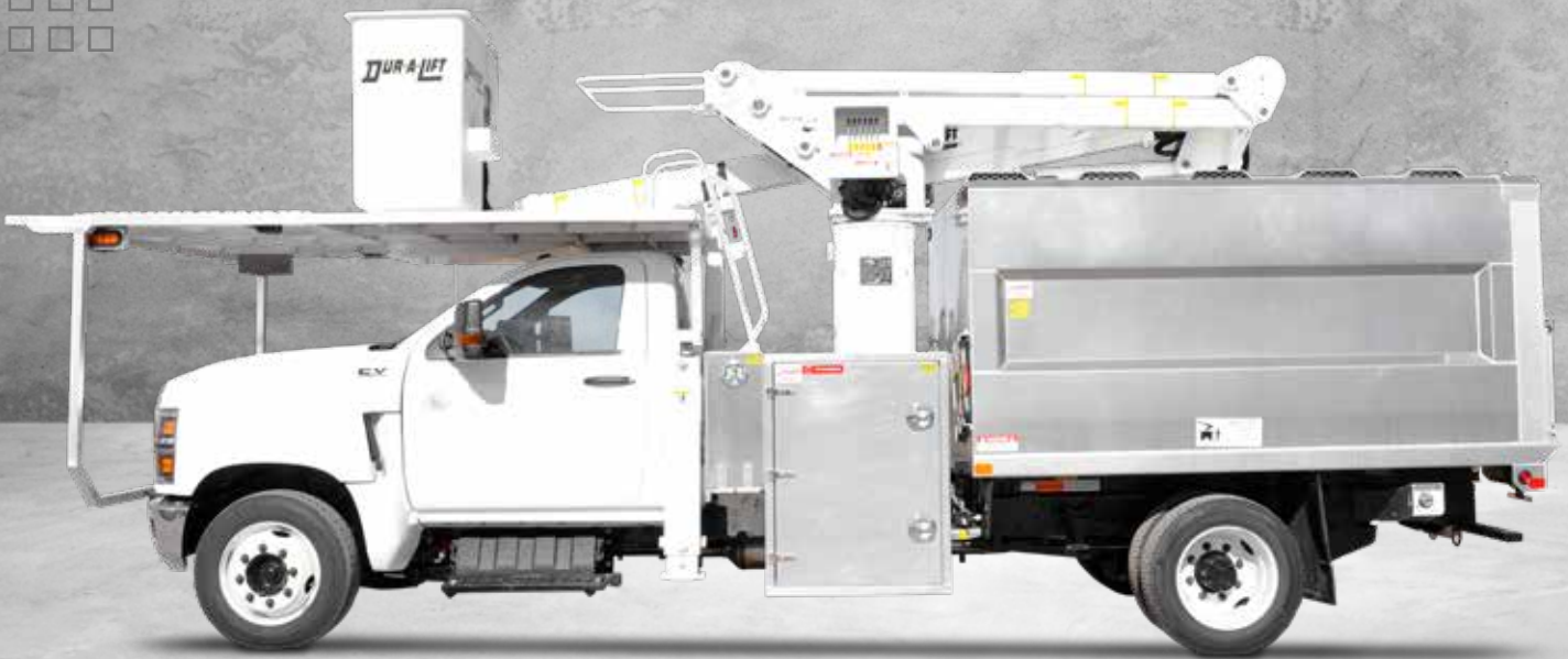
SHOWN: DTAX2-45 AERIAL WITH 9'9" CHIPPER BOX